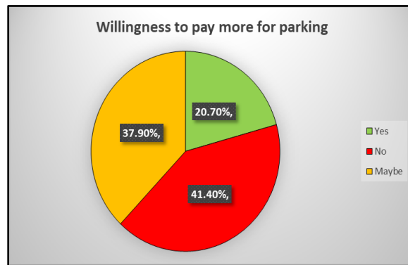
Figure 5 Willingness to pay more for secure parking

A significant majority of respondents expressed the desire for more parking spaces within the campus, indicating a pressing need to address the shortage of parking infrastructure to accommodate the growing demand. Furthermore, a notable percentage of respondents emphasized the importance of enhanced security measures for parking facilities, reflecting concerns about the safety of vehicles while parked on campus. Additionally, a smaller yet noteworthy portion of respondents underscored the significance of improved lighting in parking areas, suggesting a need to enhance visibility and safety during nighttime parking. Improving the parking road by adding permeable pavement would mitigate the challenges posed by dirt and mud accumulation, particularly during the rainy season. For congestion control, it was suggested that there should be an entry as well as exit gate which will help students and staff a lot for easily moving in and out. These findings underscore the multifaceted nature of user requirements and preferences regarding parking facilities, emphasizing the importance of incorporating diverse perspectives to develop comprehensive strategies for improving parking conditions and enhancing user satisfaction within the institute's premises.