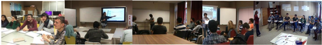
Figure 2. Laboratory and Classrooms, which were used in the research

In the research process, the data was collected from 12 courses in spring and fall semesters of 2016-2017 school year. One computer laboratory and four language classrooms were used for focus courses (Figure 2). These classrooms had sound insulation in relation with the needs of hearing-impaired students (Girgin, 2006).