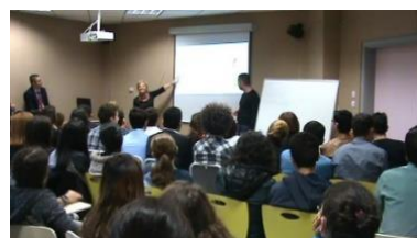
Figure 6. Presentation of Internship Coordinator (20/11/2016)

The first informative meeting of internship coordinator was held in 20/11/2016 (Figure 6). Since SFH students usually do their internship during summer, informative meetings kept going in 2016-2017 spring semester. Architectural Drafting program's meeting was held in 07-21/03/2017, Computer Operator Training program's meeting was held in 17/03/2017, and Graphic Arts program's meeting was held in 17/03/2017 (Figure 6). In addition to the informative meetings, internship coordinator is continuously supporting students in relation to their internship.