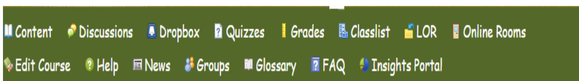
Figure 1. Electronic tools