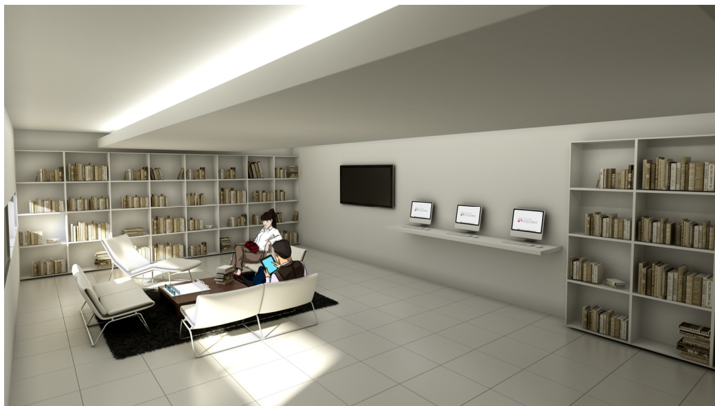
Figure 1. Lobby of ENTREExplorer game

Finally, the player is able to experiment a simulation on the virtual market, which is linked to the previous learning levels, so a good score and performance throughout the learning levels, gives more chance of being successful. A typical badly prepared entrepreneur will have a lower probability of being successful, in the contrary, a well prepared and informed entrepreneur will have a better chance of being successful in the business. Besides that, the virtual market is multiplayer and allows several online players to interact between them, which will turn this experience more immersive and enriched for the players.