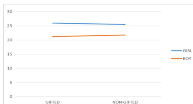
Figure 1. Averages drawing development of gifted and children of normal development by gender