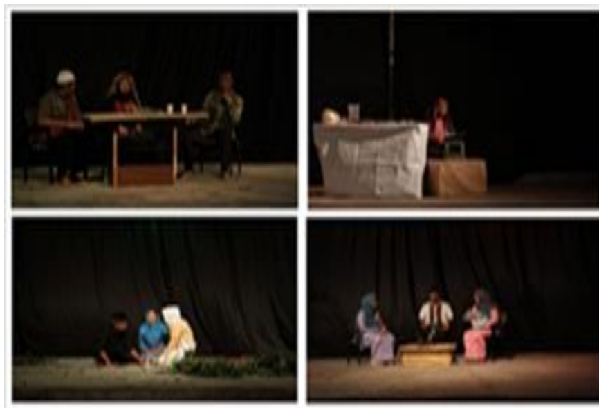
Figure 2. Student Assessment Activities in Drama Classes (Our Documentary: 2019).

The jury assessment does not affect the perception of lecturers in making assessments for each student in the class. Lecturer assessment aims to assess all of the students' activities. Meanwhile, the jury's assessment aims to appreciate the interests and responses of students learning local culture through drama classes. This researcher's preference is for achieving the planned impact of the drama class learning process. The following four photos are evidence of staging activities for the performance assessment of drama class students.