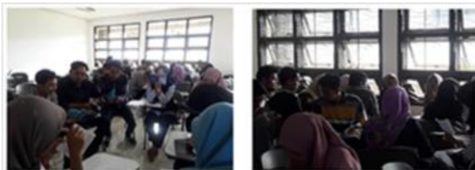
Figure 1. Student Activities in the implementation of Cooperative Learning (Our Documentary; 2019).

Lecturers assigned five Kaba titles to be read by students together in five working groups. Everyone in the working group must have the same material. The readings done together in the working groups became the material for writing the play. Each student in their working group must read critically and imaginatively their assigned Kaba story. There are five Kaba divided across five groups of students. The title of the five Kaba are: Rambun Pamenan , Puti Nilam Cayo , Rancak di Labuah , Siti Baheram , and Siti Kalasun . The activity of reading and writing plays carried out in the classroom uses collaborative learning methods. Using this method means each student must actively read and discuss with other group members the Kaba . Figure 1 shows photographs of students in the sample group who seem enthusiastic about using collaborative learning methods in their drama classes.