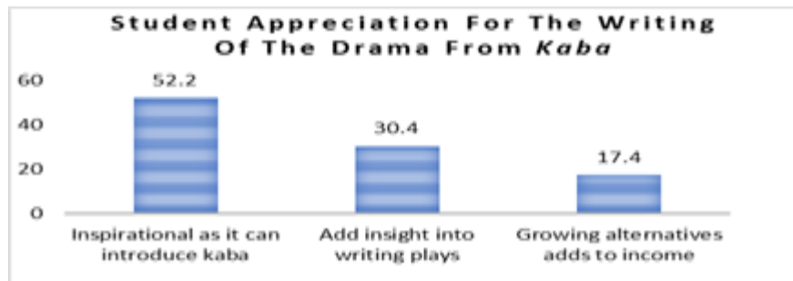
Figure 5. Student Appreciation for the Writing of the Drama from Kaba

Third, online questionnaire surveys also collected data on students' knowledge about local culture, especially Kaba . The findings of the data in Figure 5 below explain the level of student appreciation for the Kaba .