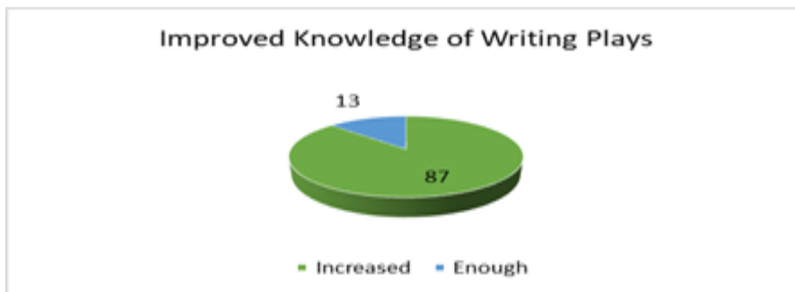
Figure 4. Improved Knowledge of Writing Plays

Second, based on a questionnaire survey, students replied that they increased their knowledge and skills in drama writing after taking drama classes. Students also reported an increase in knowledge from learning local culture. Student improvement in writing plays is shown in Figure 4 below.