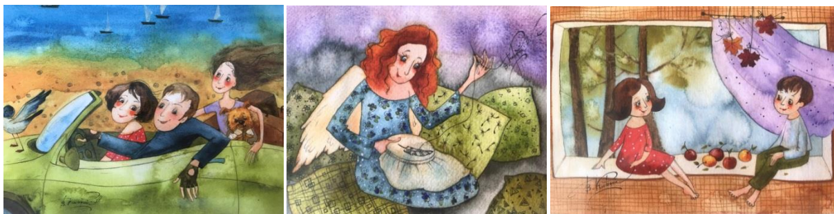
Figure 2. Metaphor cards used for communication skills work (by V. Kirdij)

Totally over seventy metaphorical cards were used, among which students chose the three that most corresponded to their feelings about their emerging interpersonal relationships. The students then arranged the cards according to their emotional significance and a psychological and diagnostic discussion followed. The interview identified the main problems and difficulties faced by the interviewees. In the next stage, the students selected from the remaining deck of metaphorical cards those cards that from their point of view would be more desirable for them (communicatively) at a given time and role-played the constructions. The effectiveness of using metaphorical cards as a means of developing communicative skills of students in the study is associated with the following opportunities: learning how to solve problematic life situations; creating an effective communication situation in a complex emotional environment; improving the interaction with the environment; creating favorable conditions for personal self-expression; developing skills of proper interaction with people around them. One should consider the results obtained.