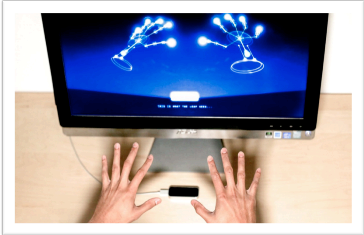
Photograph 2:

In Photograph 2; Price (2013) has explained the Leap Motion Controller with these words: we saw several months ago and what's available today comes in the form of applications. Leap has developed a demo for the controller that allows you to see on the screen what the controller sees. One demo even goes as far as to show how the Leap Motion Controller sees your hands: an astounding display that shows each individual finger and can detect even the smallest turn of your wrist.