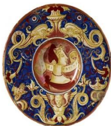
Figure 9. Faenza Plate, 1529

“Seljuk created a big art shaping the Turkish face for Anatolia” (Yetkin, 1972, p. 2). Seljuk period glazed tile and ceramic art have been a source for the periods following their period. Human figured glazed tiles are particularly important at the wall tile samples in Kubad Abad Palace constructed by Beysehir Lake in 1236.