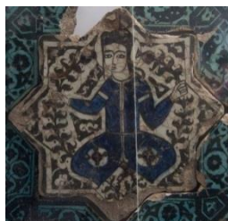
Figure 10. Seljuk Figural Designs

The effort to reach the essence in nature, science and art started with Renaissance. And this made the free thinking and placing art on scientific bases through the achieved experiences possible in association with researches. Artists changed nature and space depending on their wishes. With the chaos they created inside them, the tension in art was turned into aesthetics. As a matter of fact science is a tool for ceramics. As an example, it is supposed that the first glaze and tiles fired in high temperature were made in China. However, in the studies and laboratory researches carried out in Japan, it was found that Ancient Seto Ceramics were first glazed ceramics. There becomes chaos at the start of each scientific study. During the effort to have a conclusion within obtaining an order, certain result could be obtained in coincidence. In the works coming from the formation of ceramics, the fact that coincidence plays a role is not ignored. In this way, the only purpose sought at art is to create effects in combination with emotions and thoughts (Boratav, 1998).