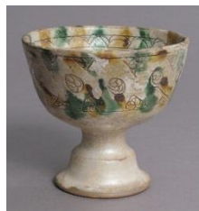
Figures 7., Figure 8. Byzantine Bowls

“Seljuk created a big art shaping the Turkish face for Anatolia” (Yetkin, 1972, p. 2). Seljuk period glazed tile and ceramic art have been a source for the periods following their period. Human figured glazed tiles are particularly important at the wall tile samples in Kubad Abad Palace constructed by Beysehir Lake in 1236.