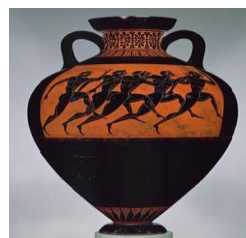
Figure 5. Panathenaic Amphora

Mythological scenes, particularly Mayan Underground Epic were depicted in the classical Mayan ceramics which were used as a burial chamber. The dishes, particularly chocolate dishes were used as the final task on the graves of the dead. In the process when Western art and culture were shaped with the Greek mythology, the decorations on the ceramic plates with a high value of function in Ancient Greek and on those of the Classical Period were given special attention. For that reason, they have a different content compared to other cultures. "Thanks to the commercial relation with the East, Greek artists translated the mythos expressed in painting, sculpture and architecture into the language of art" (Gezgin, 2008). Ceramic plate has an artistic value for the Greek people. While experiencing the process of creation, the acquisitions obtained through some symbols on ceramic pots. Transforming into the work of art with the materials used in this process reproduced the taste.