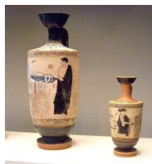
Figure 4. Greek Oil Jars