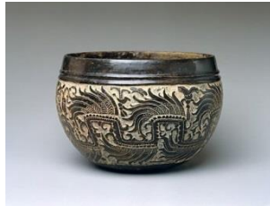
Figure 1. Carved Bowl, Maya

“With expression, which is one of the most significant characteristics of art, ideas and perceptions are visualized through art, they improve and change” (Erinc, 1995).