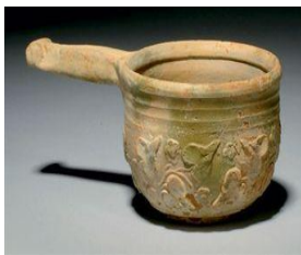
Figure 6. Roman pottery