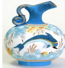
Figure 2. Minoan Dolphin Oinochoe Greek Vase

Ceramics was visualized in this sense with the purpose of conveying feelings, ideas and tastes to another one and used as a communication instrument with its plastic structure.