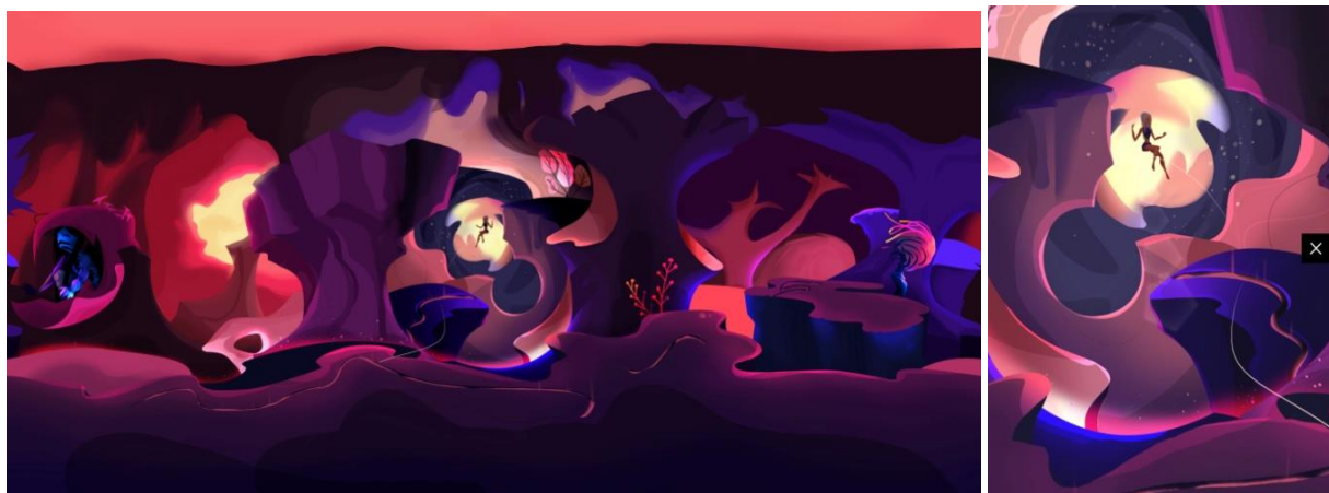
Figure 3. 360° panoramic illustration. ( https://kuula.co/post/7lg1h )

To display the obtained illustrations, aforementioned hand-based virtual reality technique can be used. Display systems consisting of Art Station, Kulla and similar web platforms enable drawings to be viewed in a virtual reality application form (Figure 3). New generation mobile devices perceive user motions and display images accordingly.