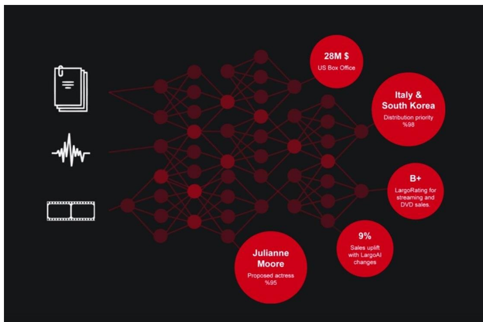
Figure 3. LargoAI interface for movie analysis (2019)

of the film's release. The true box office gross of the film was €1.7 million. LargoAI has three spots that are focused on. The first is content analysis, which can be referred to as the pre-production stage. The platform can analyse a script and detect its genre. After doing so, it can give an enhanced report about possible audience reaction. Moreover, it can also provide data regarding country-based audience reaction (Davies, 2019). This aspect is the leading feature and has spread on other stages as well.