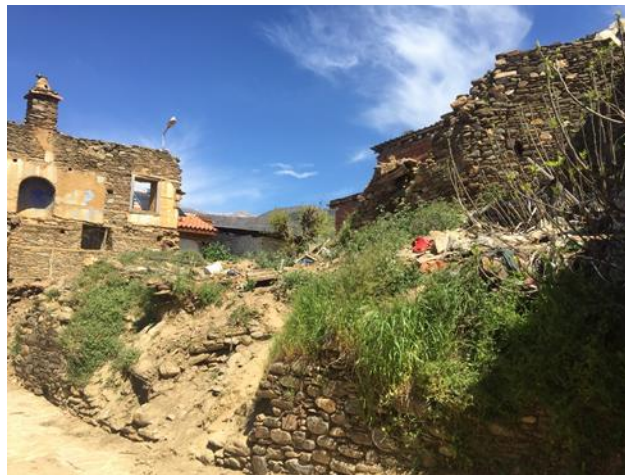
Figure 3. North wall from which chimney, stove and windows can be viewed, 2019