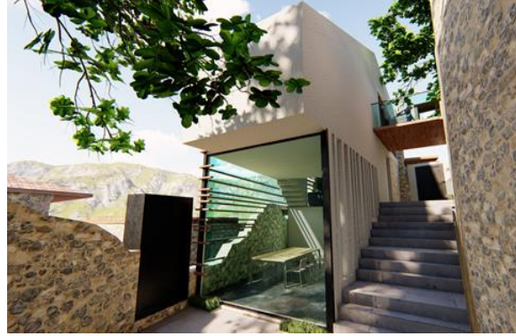
Figure 7. View of the workshop volume from the garden