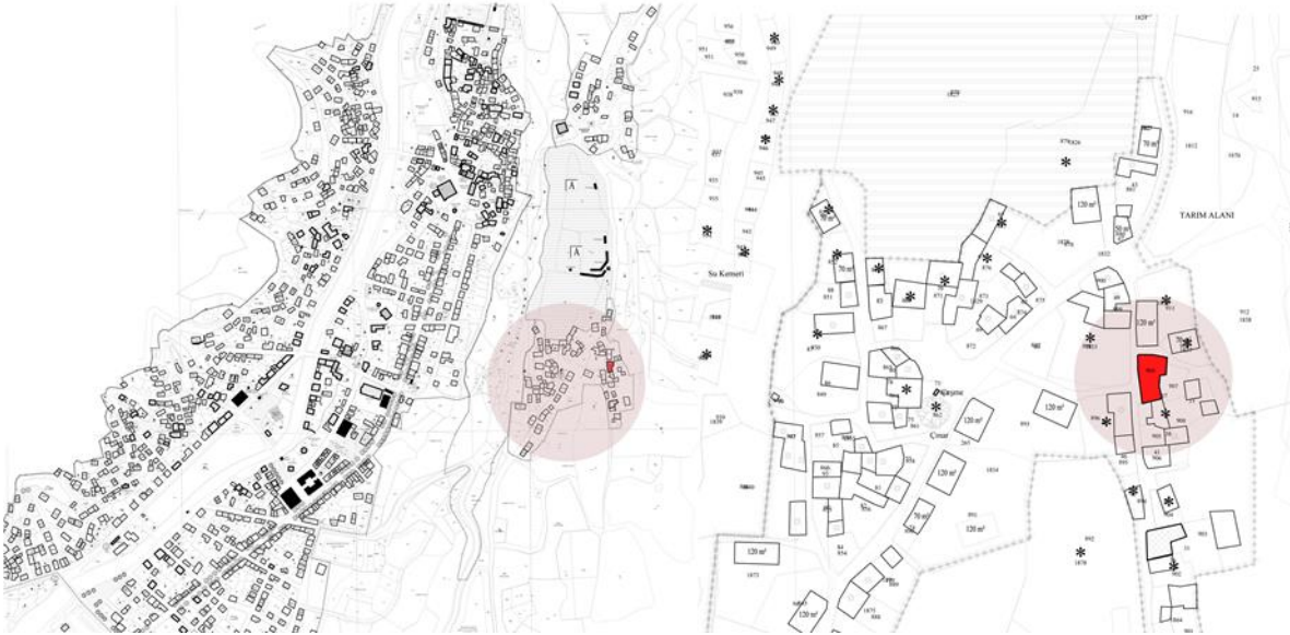
Figure 1. Taşpazar and its location in the study area

Taşpazar locality, where the structure subject to the study is located, is a low-density residential area located on the outer periphery of Birgi, surrounded by natural landscape. However, the economic difficulties and lack of education opportunities in the process caused the local users to leave the region. For this reason, today's building stock of the area consists of traditional residences that are still in use and buildings that have lost their users and become abandoned and physically worn out. On the other hand, the dynamism experienced in the centre of Birgi also affected the region and the street improvement studies started in 2016. In this context, simple repairs and street-scale improvements were made in the buildings in the Taşpazar area. After the studies, it is observed that the commercial and cultural dynamism in the centre shifted to Taşpazar and ownership change started in some buildings.