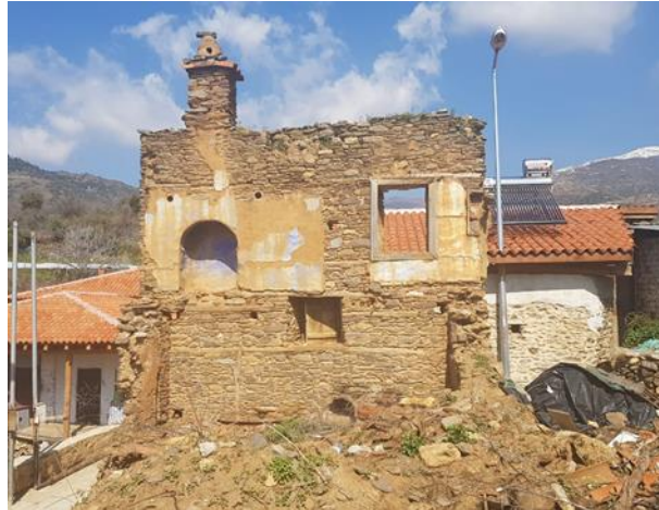
Figure 2. General view of the building, 2019