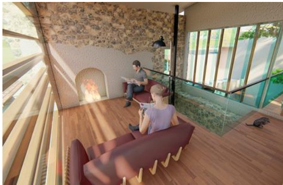
Figure 8. Living area