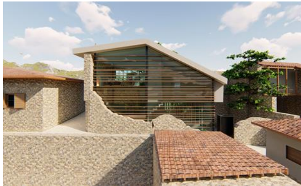
Figure 4. The west facade of the building

location. The function-oriented programme is designed as a workshop, dining area, living area and sleeping area. When the traditional residential life in the surrounding is examined, the importance and widespread use of open and semi-open spaces has been determined and in this direction, the programme setup has been expanded with the needs of terraces and gardens. Another important result of the field studies and literature reviews on the traditional Birgi residential texture and Turkish house has been the presence of more than one function in a single volume (Bektas, 2018). In the design, it is aimed to interpret this spatial practice with the use of modern open plan. The existing original wall remains formed the spatial boundaries, and the continuation of the use of the hearth determined the position of the sitting area. Another design decision was to maintain the material culture and building tectonics. Wooden beams within the characteristic stone structure of the building and garden walls were interpreted as wooden sunshades. With a similar approach, the geometry of the broken roofs, which draws attention in the architectural pattern, was taken as a basis in the shaping of the building shell.