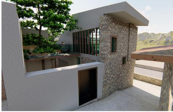
Figure 6. North direction entrance