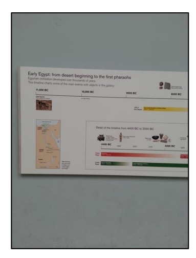
Figure 5: Fixed infographics examples.