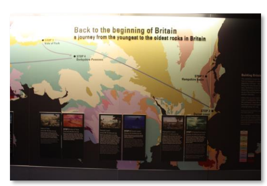
Figure 1: The examples of infographics in Natural History Museum, London, 2015.

The need for information has increased today with the changes occurring in technology and communication and as a result, an information pile and confusion has occurred. The design of the information, that is, infographics, which enables this confusion and masses of information to be conveyed visually in a more orderly, systematic and understandable way, is becoming more important day by day (Uyan Dur, 2014). Infographic is the presentation of information sets that seem complicated with a visual arrangement which everyone can understand. "Infographic is short for information graphic" (Wei Su, Li Liu, Wang, & Yu., 2018). Infographics provide impressive and useful communication for viewers. While infographic designs can be seen related to many issues encountered in daily life, it is also possible to see these infographics in web environments, magazines and newspapers, museums, public spaces, and the use of various means of transportation. Infographics took the present form of expression with the ISOTYPE system created by the Viennese economist Otto Neurath at the beginning of the 20th century. According to Otto Neurath (2012), knowledge should be accessible and understandable regardless of the culture and educational background of people.