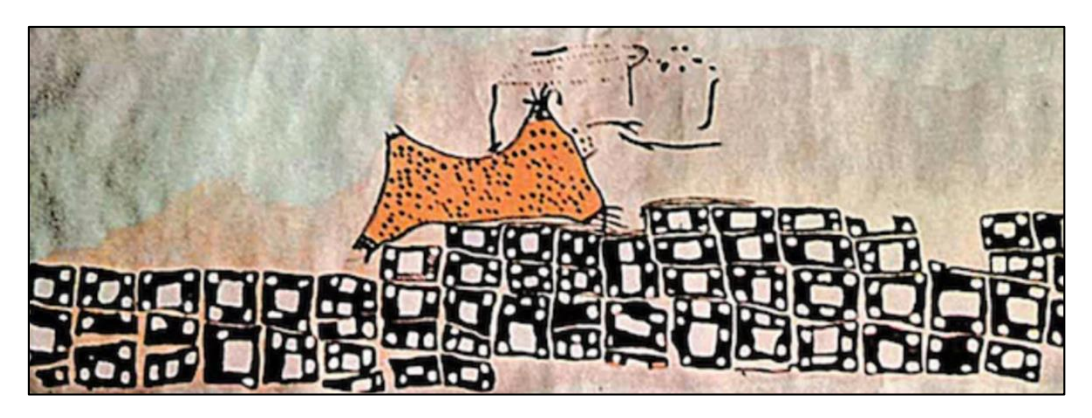
Figure 4: Plan of Çatalhöyük City.

The London subway map, designed by British engineer Henry Beck in 1933, is an understandable and functional information graphic example of the period because it was designed without considering cartographic features compared to the other known maps. It has an exemplary design approach that has standardized similar studies in the world in terms of its functionality and each color code used to indicate a different subway and station (Coates & Ellison, 2014). In Turkey, in 2012, a city plan which was made on a wall surface found as a result of excavations conducted at Çatalhöyük which is one of the oldest settlement in the world was accepted to the World Heritage List by UNESCO. The painting, which is about 2.75 cm long, depicts the outer plans of about 80 houses in that surrounding as well as the interior plans, and it has survived to this day as one of the oldest works designed for information.