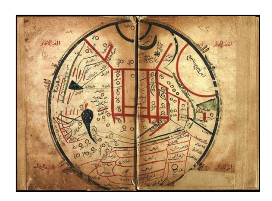
Figure 2: Turkish World map, Kaşgarlı Mahmud, 11th century.