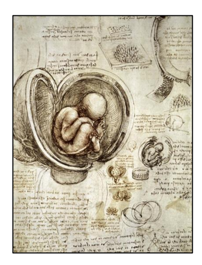
Figure 3: Leonardo Da Vinci Studies.