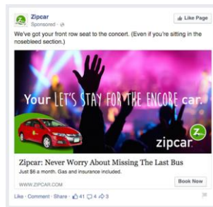
Image 2. Zipcar Facebook Ad ( http://www.redmangomarketing.com/news-updates/facebook-ad-relevance-score-2015-03-1161 )