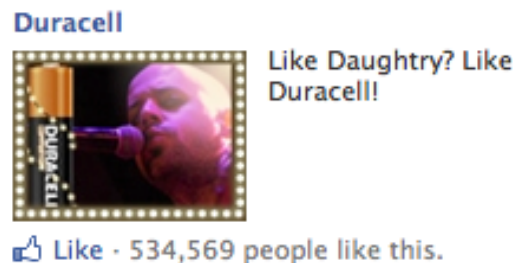
Image 1. Duracell Facebook Ad

Graphic design in advertising combine elements that help convey the message to the consumer in a fast, easy and efficient manner. The target audience, content and message must be determined for an accurate communication design. The slogan of the advertisement must be catchy and positioned correctly in the design. According to Evans and Thomas (2008); principles, research and application are equally important for a designer as formulas and guidelines for a mathematician or research for a sociologist. When creativity is added, the result will not just be a useful product, but one that is aesthetic and pleasant for senses as well.