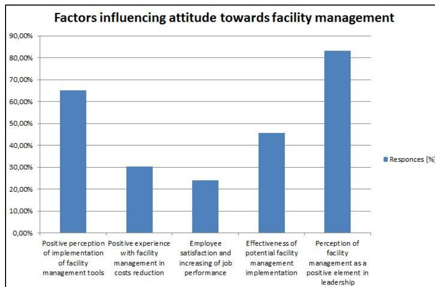
Figure 2. Factors influencing attitude towards facility management