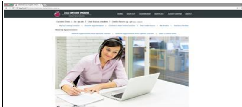
Figure 4 Default Screen