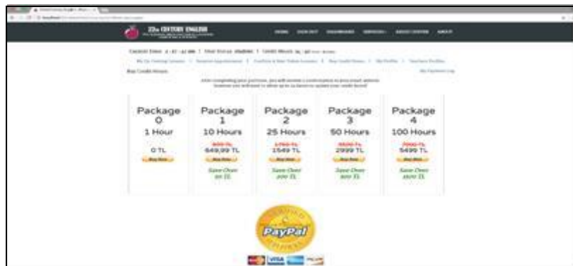
Figure 3 Payments page