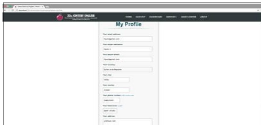
Figure 5 Personal Information and Edit page

On this page, students can change their personal information