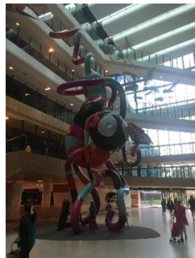
Figure 6. Hospital common space