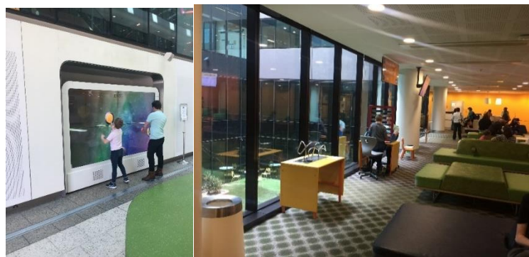
Figure 9. Play surfaces, social locations

There are many social areas within the building. There are applications in common venues where game related actions can be found. ‘The Book Banker’, which children can use free of charge, has a common space called ‘Starlights Room’ where they can spend time with their families.