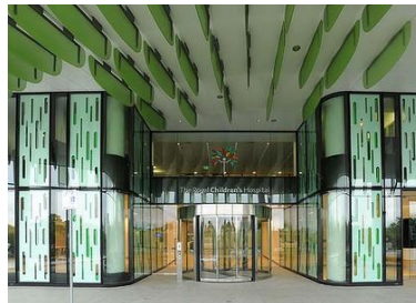
Figure 5. Entrance area