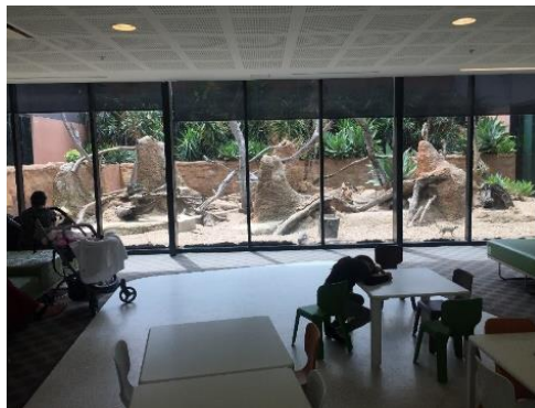
Figure 8. Ground floor, waiting and market live area

Joint space is the centre of the structure in terms of architectural organisation. There is a sense of space inside the green area and the water element. In order to increase the relationship, the waiting areas walls were made of transparent surfaces to make the waiting easier for children, there has been created a living area for markets. There are large garden and play area not visible from the main entrance. The use of all areas is open to both working staff and patients and their relatives.