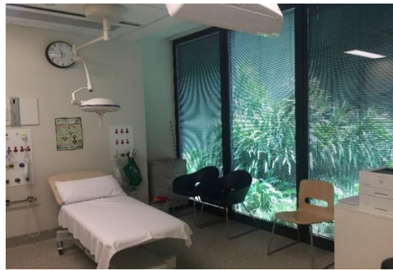
Figure 11. Patient room.

There is one floor provided as an accommodation facility for patient relatives. The floors were separated into the clinics and every floor to enable easy room to be found for children and their relatives which were defined graphically with different colours and animals. Interior fittings are designed in a dimensional and formal sense according to user types. Patient rooms have been designed with an effort to create a home environment to benefit from the sun’s rays.