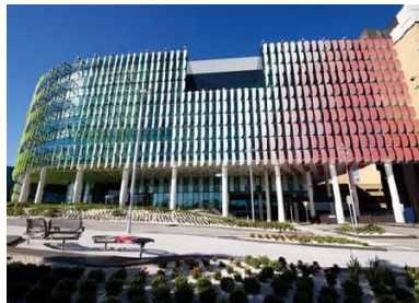
Figure 4. Hospital approach

The location of the building has been positioned as it can be seen in the Melbourne zoo, which provided to communicate with people through natural living. The approach to the hospital is made within the landscape with the green area with a defined entrance. The entrance area is a common space with high ceilings which is designed as a gallery space located in the centre. There is an artwork inspired by monkeys, ants and spiders, which have become symbols of this common space structure. The sculpture was designed by a Melbourne artist to improve the imagination of children. Most of the social spaces are located in this centre.