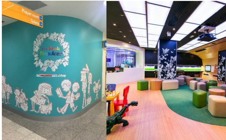
Figure 10. The book banker and starlights room

There is one floor provided as an accommodation facility for patient relatives. The floors were separated into the clinics and every floor to enable easy room to be found for children and their relatives which were defined graphically with different colours and animals. Interior fittings are designed in a dimensional and formal sense according to user types. Patient rooms have been designed with an effort to create a home environment to benefit from the sun’s rays.