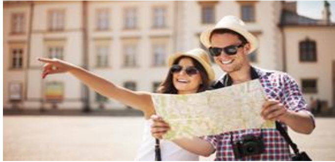
Figure 6. Shows the reference to the protagonist's longing for his wife