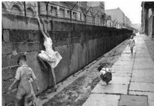
Figure 2. Children playing at a wall