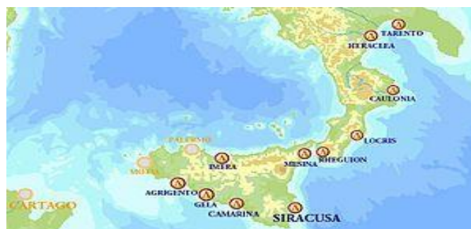
Figure 5. The protagonist's itinerary to his dream destination Syracuse