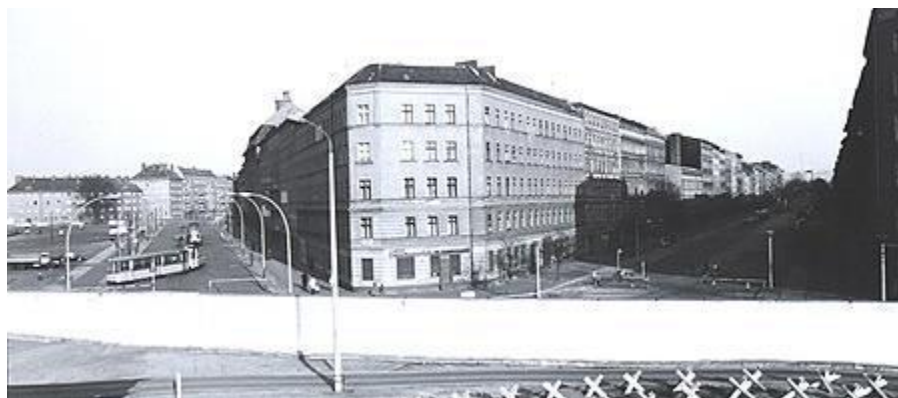
Figure 3. The separation by the wall in Berlin