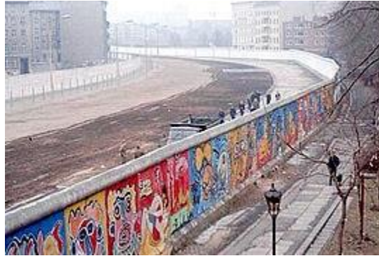
Figure 1. The Wall of Berlin from the western side