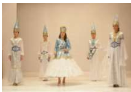
Figure 2. Detail of performances from the team member from the Republic of Tatarstan at the final stage of All-Russian Olympiad on Technology

Thus, the creation of conditions at the government level for the development and support of Olympiad movement in the Republic of Tatarstan allows students to achieve significant progress, thus ensuring the preservation and enhancement of its intellectual and creative potential. We hope that our