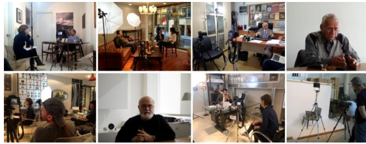
Figure 2. Visuals from the process