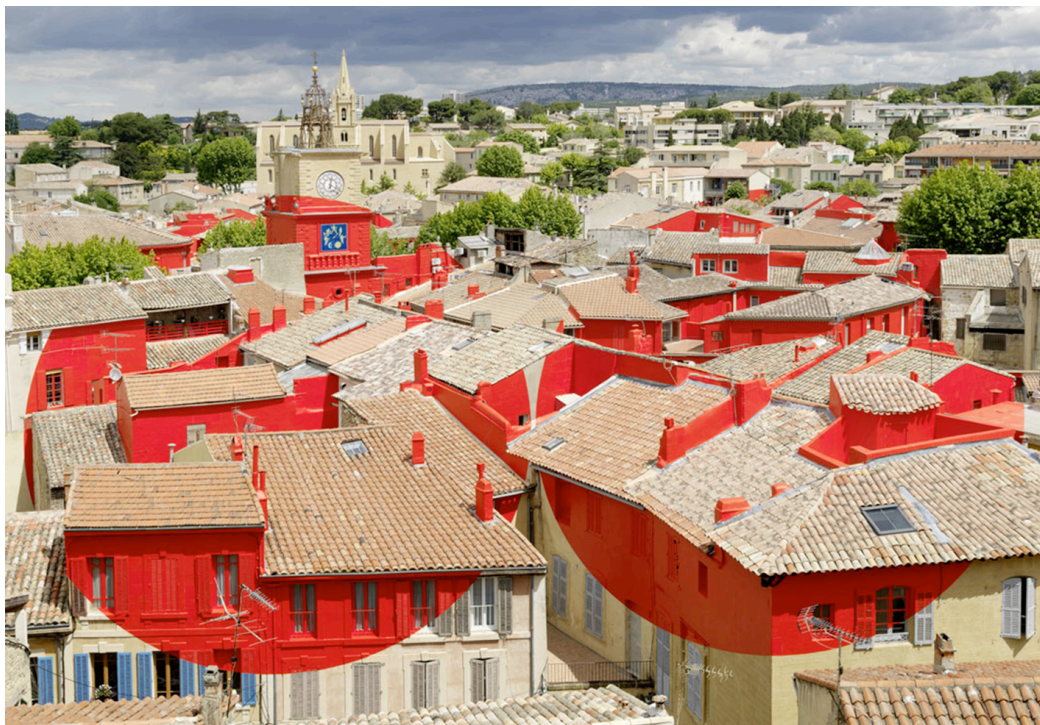
Figure 2. Felice Varini, Doble disque évidé par les toits, Salon de Provence / Marseille, Marsiglia, 2013

The search for the right point of view is the essential element in the work of Felice Varini. Indeed, it is the key to reading and visualizing his entire opus because he conceived it for this particular point. Hence perspective lies at the foundations of his artistic approach and functions as the point of departure for his technical efforts (Varini, 1999). The point of view is always selected in relation to the characteristic features of the architectural space. It always takes account of the elements to be emphasized on the basis of how the place is going to be used by the spectator.