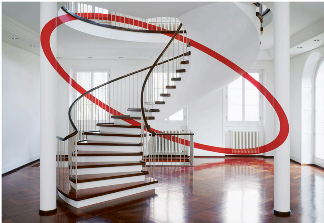
Figure 3. Felice Varini, Ellipse rouge en diagonale pour deux colonnes, “Points de vue sur Wolfsberg”, Ermatingen, Suisse, 1997.

The observer moves through architectonic space without any indication as to the position of the point of view, which the artist does not identify or reveal in any way. Thus the work of Varini is based on the duality between the point of view – which fulfils the work of art – and the multiplicity of viewpoints of the observers who happen to use the space catching many various perspectives on various elements of the work. In the stage of designing, therefore, the eye of Varini, assumes the position in the very center of the projection of the perspective while leaving to the eyes of the observer the possibility to catch sight of other perspectives. In this way, he links tradition and modernity, reality and illusory perception. Already by the act of choosing colors he makes the first step towards the world of illusion. As mentioned above he uses primary colors, which are more luminous. They evoke those articulated by De Stijl and are definitely artificial, belonging thus to the world of artefacts and as such they do not exist in the real world. Even though at the beginning of his activity he searched for the tight relation between the choice of colour and space, in his later opus he becomes pretty free and uses colour regardless of the space in which he finds himself to be.