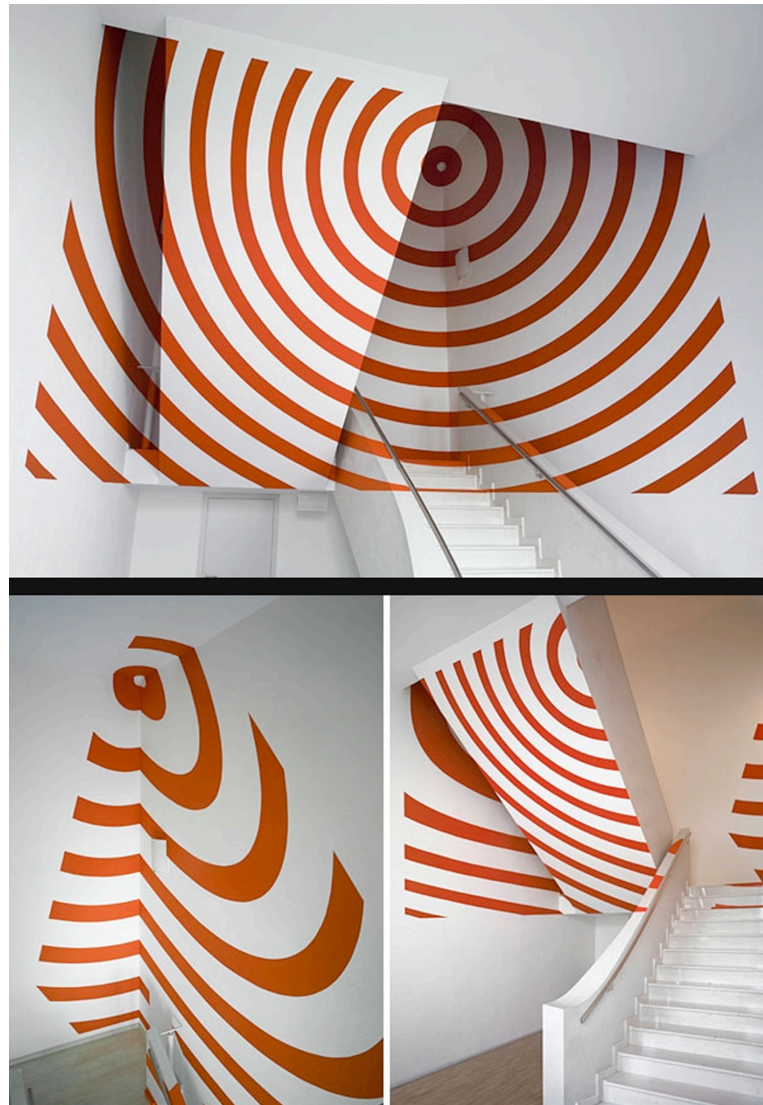
Figure 1. “Corone e centri concentrici per l’angolo, arancioni”, Expo Arte in Ticino 1953-2003.