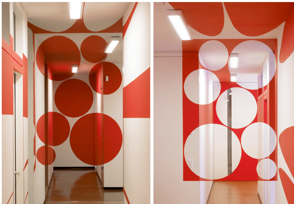
Figure 4. Felice Varini, Tra il pieno e il vuoto, Collezione oncologia Varini&Calderoni, Lugano, 2003

What is more, the fact of placing painting upon architecture creates in his work rather unique oppositions and connections: tensions between content and form, concrete space and abstract space, between two-dimensionality and three-dimensionality.