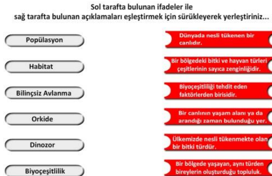
Figure 3. Web-assisted word association example