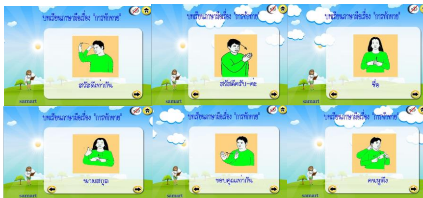
Figure 2. The Multimedia Games according to Constructivism Theory