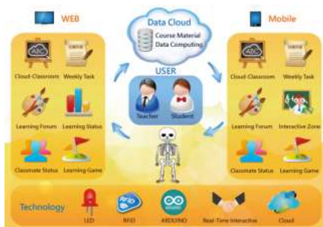
Figure 1. The cloud classroom of the skeletal system system architecture

The system structure contains three layers. All the system components were from cloud components. Thus, in the designing and developing process, there is no need for programming for each application platform. All that needed to be done was to rearrange the operation interfaces. This is a rather efficient way for software development. In this system, there are a lot of data of multimedia content, professional medical terms, English pronunciations, and skeletal structure associations, which are all stored on the data cloud. Based on these data, a computing cloud was designed to offer services such as learning effect presentation, real-time exams, and individual learner condition review, through both the web platform and the mobile device platform. This design also allows future extension.