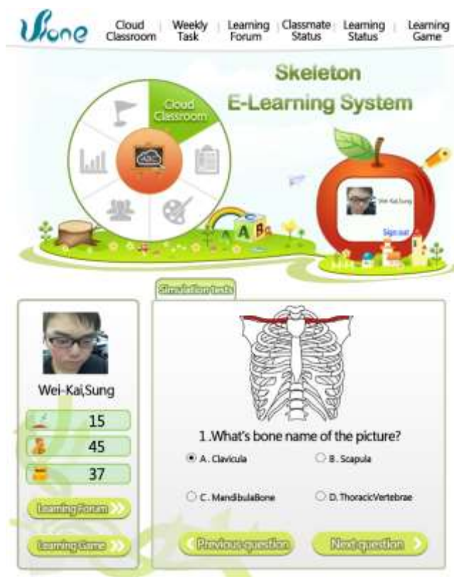
Figure 3. The Exams of Skeleton System

The system structure contains two main platforms, the web platform (Web) and the mobile device platform (APP). Based on the concept of social groups and the method of playing games, this system can increase users' interest. Through the cloud technology, the two main platforms can be combined with physical teaching aids so that users can learn more about the skeletal structure. The indicators were designed based on the ARCS (attention, relevance, confidence, and satisfaction) model. The use of the cloud technology largely increases the range of applications. As long as there is internet access, one can learn easily. This system offers different functions for different users and user scenarios. The functions of the "cloud classroom for medical science: skeletal system as an example" are as below: