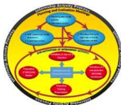
Figure 4. Internship activity process

The cycle of Internship activity process is shown in Figure 4. The internship activity was performed with simultaneous and sequential sub-activities (Table 3).