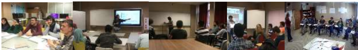
Figure 2. Laboratory and classrooms, which were used in the research

In the research process, the data was collected from 12 courses in spring and fall semesters of 2016-2017 school year. One computer laboratory and four language classrooms were used for focus courses (Figure 2). These classrooms had sound insulation in relation with the needs of hearing-impaired students (Girgin, 2006).