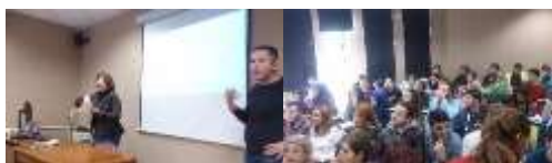
Figure 5. Internship stories presentation

Other sub-activities in focus courses were performed simultaneously, during the end of Internship Stories activity.