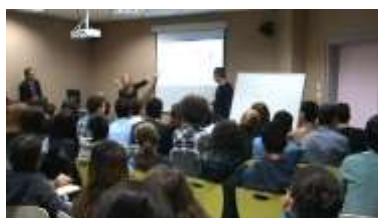
Figure 6. Presentation of internship coordinator (20/11/2016)

The first informative meeting of internship coordinator was held in 20/11/2016 (Figure 6). Since SFH students usually do their internship during the summer, informative meetings kept going in 2016-2017 spring semester. Architectural Drafting program's meeting was held in 07-21/03/2017, Computer Operator Training program's meeting was held in 17/03/2017, and Graphic Arts program's meeting was held in 17/03/2017 (Figure 6). In addition to the informative meetings, internship coordinator is continuously supporting students in relation to their internship.