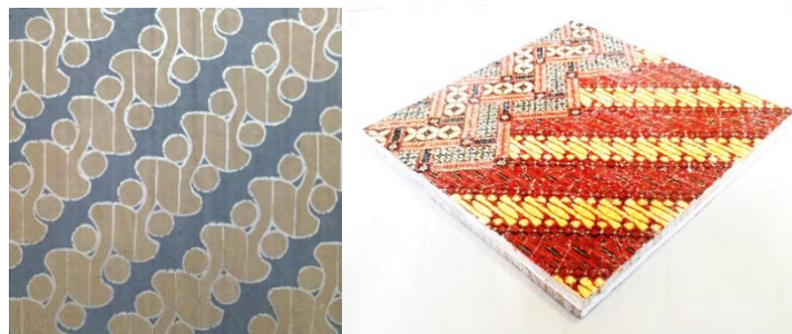
Figure 7. Batik parang patterned on paper board surface

In this study, the paper board is made to display the surface with a parang motif. It is a batik parang, which is the easiest batik motif to apply. This experiment shows that waste paper, in this case packing paper, can also be implemented to form batik motifs. The final form is as in Figure 7.