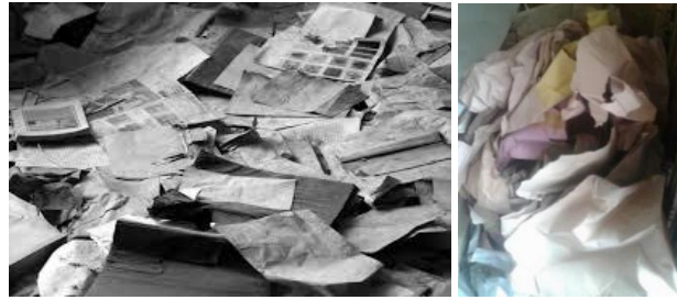
Figure 5. Paper waste

The manufacturing process is exactly similar to that of the dry leaf board. The texture on the outer surface is formed as a result of its core shape. In this study, paper board experiments were done using packing paper. The result is as given in Figure 6.