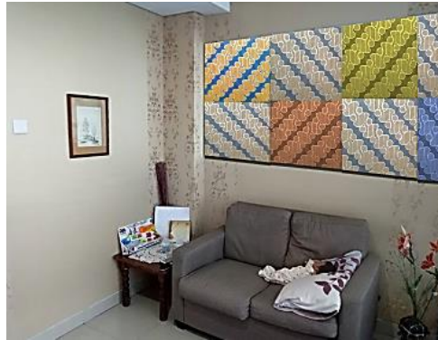
Figure 8. Applying paper board in interior of residence