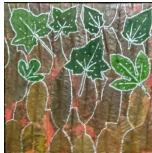
Figure 3. Batik with leaf motif on dry leaf board surface

The application is to form a leaf batik motif on a dry leaf board. Since the main ingredient of dry leaf board is leaf, the formation of batik motif on surface is reasonable. Some leaves of various types and colours, as mentioned above, are strung together to form a leaf-patterned batik on the outer surface. The leaf motif is seen from the arrangement of leaves that form a pattern and do not look random. The end result can be seen in the picture in Figure 3.