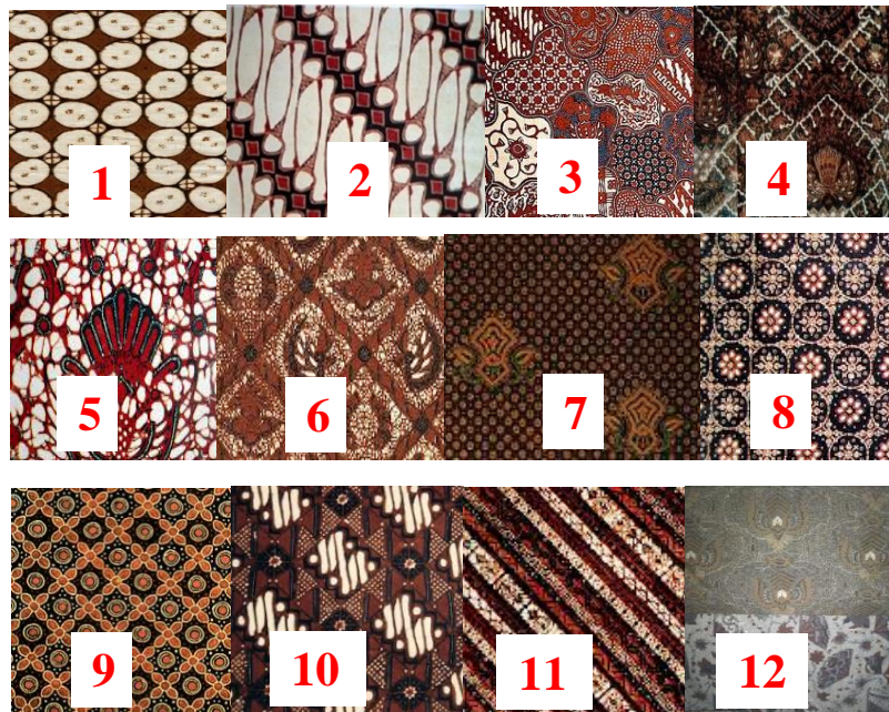
Figure 2. Various motifs of batik