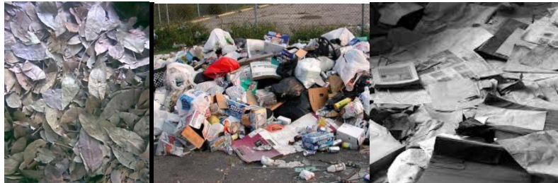
Figure 1. Urban waste

Urban waste in the form of sheets was collected and utilised as a board by applying the configuration of a vertical cross. The resulting panel product was called an aesthetic board. In aesthetic board production, the configuration of vertical cross was applied in an original, accurate and optimal manner. This composition formed an aesthetic board that was strong, rigid and hard. The outer surface was coated with a waste sheet that produced unique and original texture visualisations.