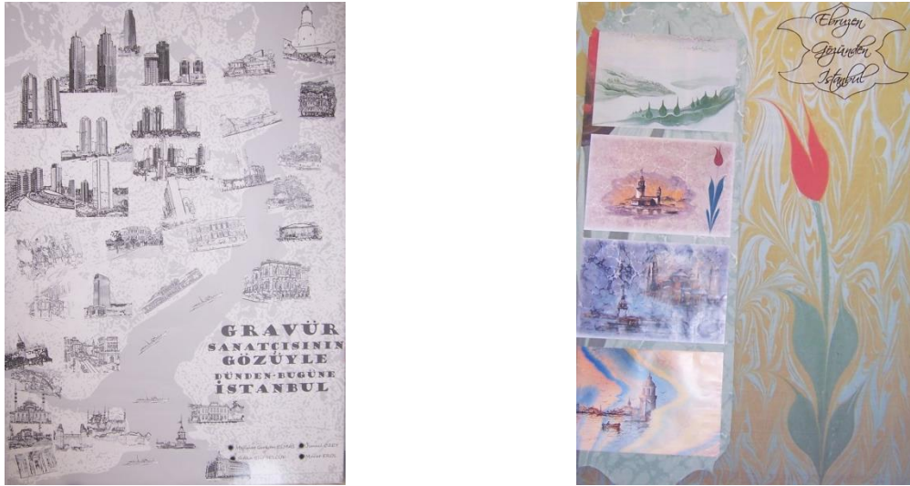
Figure 2. (a) Student project ; (b) Student project

asked to make a 2-D collage work with materials such as photographs, articles, brochures etc. regarding the city elements that have been seen by and garnered the attention of the student while travelling in the city on the predetermined route. In this collage work, the elements that first strike the eye in the city are emphasized. These elements are an ensemble of inert, eventless points, lines, planes, volumes and shapes. And this ensemble can belong to either one specific zone or the city as a whole (Fig.2.).