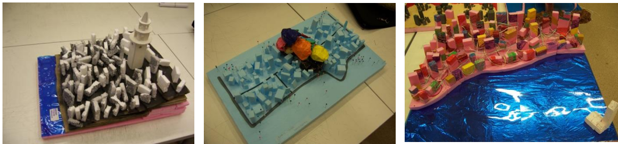
Figure 5. (a) Student project ; (b) Student project ; (c) Student project

When city spaces transform into structures, the city becomes a complex pile of geometries. This ensemble of masses forms the structured environment. This structured environment is surrounded with various sizes. Seeing this structured environment only with its geometry or with its volumetric situations that describe their reasons for being is a way of understanding the diversity of forms. In this way, the pieces of the city become visible. The city is freed from its excesses, and is revealed in its glorious nakedness (Fig.5.).