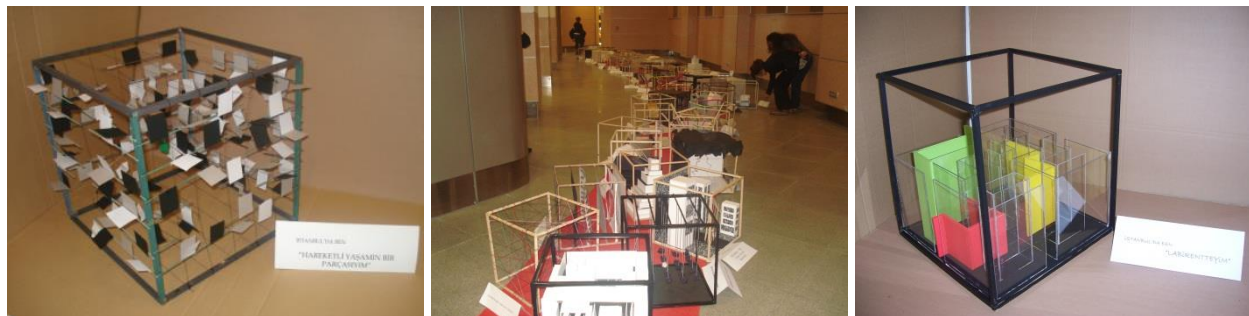
Figure 3. (a) Student project; (b) Exhibition; (c) Student project

The student is asked to pick up a concept that expresses how he felt in the city, so that he can understand the effects of these elements on the city's residents. The process continues with the student performing an interpretation study about how he feels among the emptied inert volumes, planes and lines existing in the city. This concept is described through abstraction within a 3-D cube, and emerges and gains meaning through the relationship built by an element of one part of the city with people. In Istanbul, I am alone, in chaos, lost (Fig.3.).