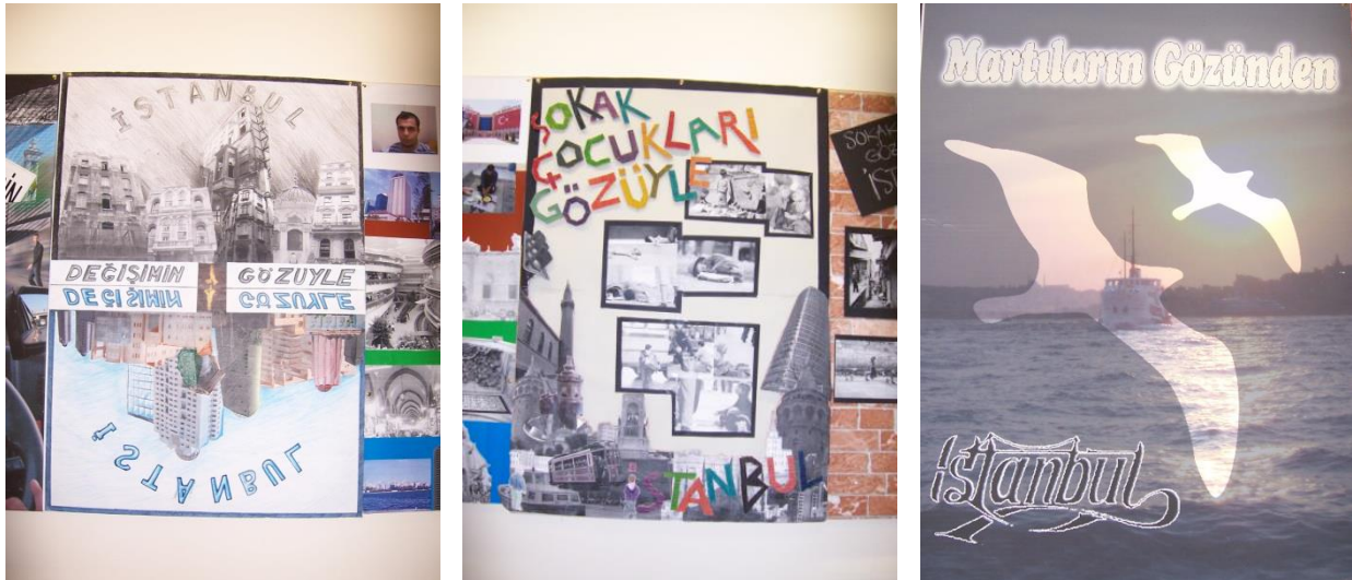
Figure 4. (a) Student project ; (b) Student project ; (c) Student project

An individual expressing his/her own feelings in 3-D can also describe the city from the view of others. City-dwellers live in the spaces that belong to the city. These spaces are composed of elements and actions/events. In the city consisting of singular and plural lives, the spaces where the city-dweller lives are revealed. This city-dweller can be a child, an old-aged person, or even a dog. Then the student analyzes how the city looks from that city-dwellers eye. The pieces/parts of the city are then reread based on the people and spaces (Fig.4.).