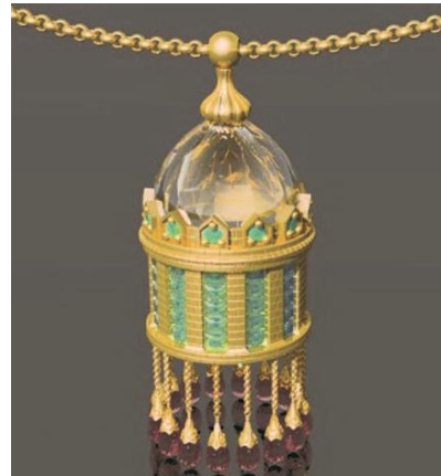
Figure 14: Kazan Cathedral Stone Pendant