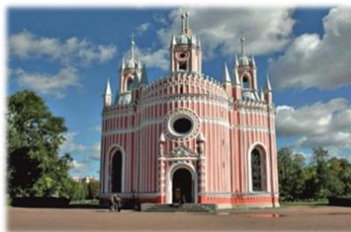
Figure 2: Chesme Church ( http://www.st-petersburg-essentialguide.com/churches-in-st-petersburg.html#gallery[pageGallery]/14/ : Accessed on: 01.06.2015)