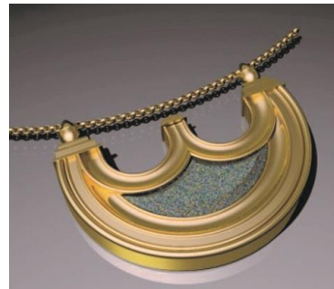
Figure 8: Voskresenia Khristova Pendant