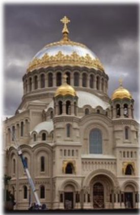
Figure 11: Naval Cathedral