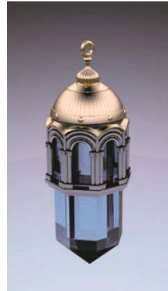
Figure 12: Naval Cathedral Stone Pendant