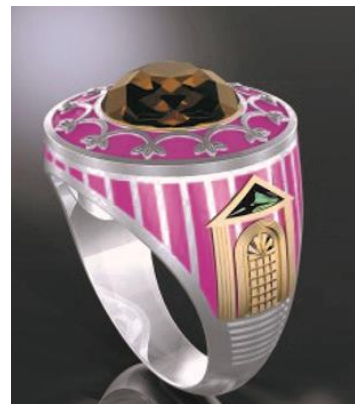
Figure 10: Chesme Church Ring