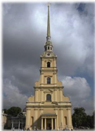
Figure 15: Peter and Paul Katedrali