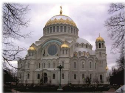
Figure 3: Naval Cathedral ( http://www.angelfire.com/pa/ImperialRussian/