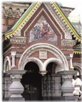
Figure 7: Voskresenia Khristova Church