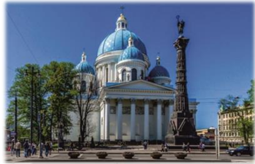
Figure 6: Trinity Cathedral ( http://www.saint-petersburg.com/cathedrals/Trinity-Cathedral.asp : Accessed on: 07.06.2015)