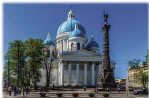
Figure 19: Trinity Cathedral