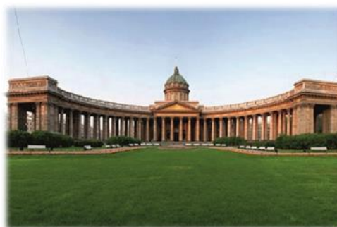
Figure 4: Kazan Cathedral