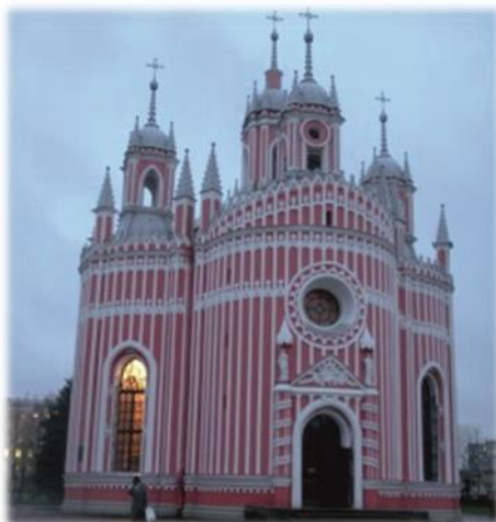
Figure 9: Chesme Church