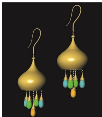
Figure 18: Voskresenia Khristova Earrings