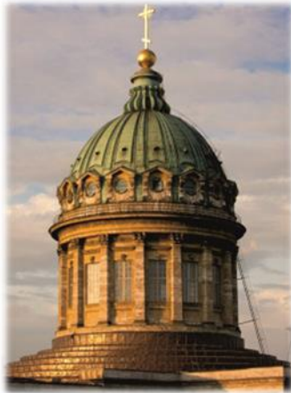
Figure 13: Kazan Cathedral