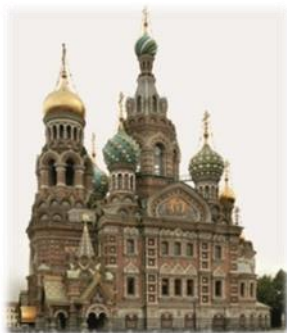
Figure 1: Voskresenia Khristova Church