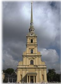
Figure 5: Peter and Paul Cathedral http://www.spbmuseum.ru/exhibits_and_exhibitions/92/1316/ : Accessed on: 01.06.2015)

petersburg.com/virtual-tour/kazan-cathedral/: Accessed on: 22.05.2015)