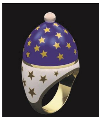
Figure 20: Trinity Cathedral Ring