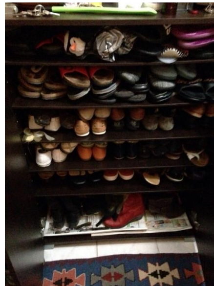
Figure 4. (a) Boxes in the shoe case of interviewee 1; (b) Shoe case of interviewee 1.