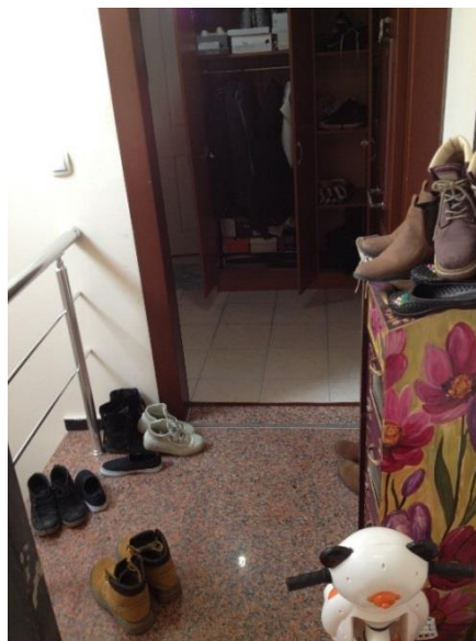
Figure 1. Out of the door of interviewee 7.

“In my opinion there is need for an interface between home and the rest of the apartment. There is always an anxiety about getting the place dirty. There is always a doubt where the border is to keep the home clean.” (Interviewee 9)