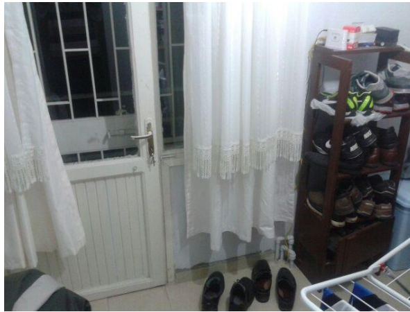
Figure 6. Shoe case of interviewee 6.

“The concept of “apartment shoe” is just ugly because everyone gives this function after they decide it as the ugliest shoe of their life. No one wishes to steal them and they always occupy the stairs in an unaesthetic way.” (Interviewee 2)