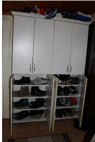
Figure 3. Shoe case of interviewee 5.

Organizing shoes in boxes could lead a disorder when they are just put in boxes. This problem is analyzed by a user and two different solution is created by functions and the conditions of the shoes as mentioned below: