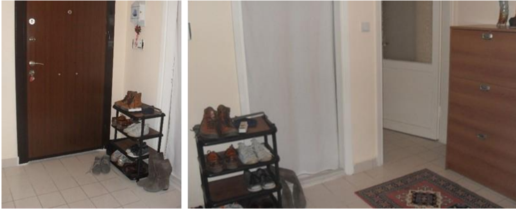
Figure 2. (a) Transition area between in and out; (b) An interface that is separated by carpet from the house of interviewee 9.

“Streets are dirty in Turkey. I prefer to sit down, lay down on the carpet when I’m at home and for me it is not possible to enter home with the shoes for that reason.” (Interviewee 2)