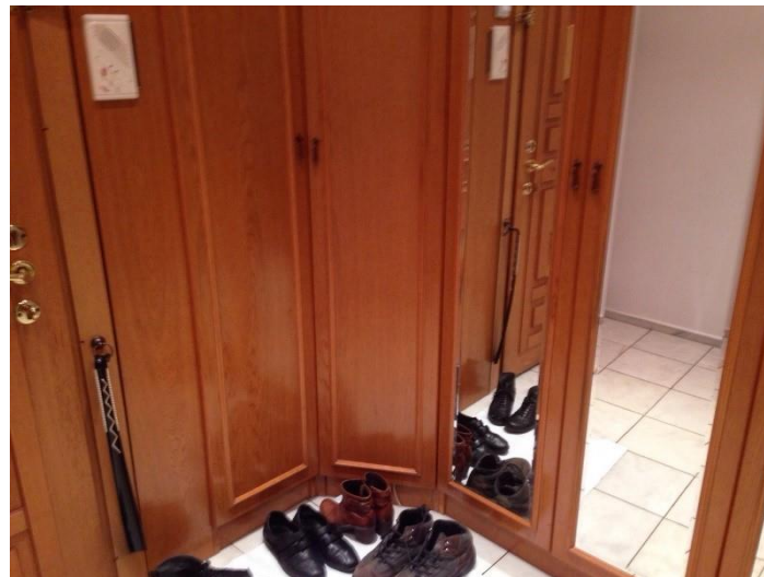
Figure 7. Shoe case of interviewee 4.

“We don’t have an “apartment shoe” at our place even if we may need it to visit my aunt leaving one level down. I have never seen any shoe out of the doors in my apartment. The reason could be living with upper middle class neighbors.” (Interviewee 4)