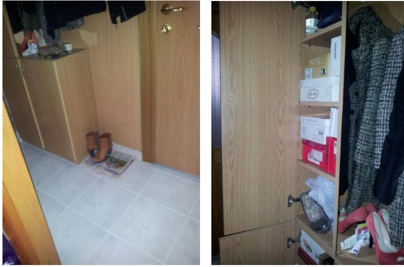
Figure 8. (a) Usage of newspaper as temporal and fast solution by interviewee 2; (b) Shoe case of interviewee 2.