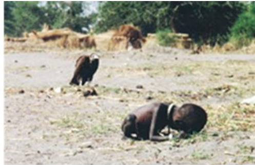
Kevin Carter, Child and Vulture , 1994 Pulitzer.