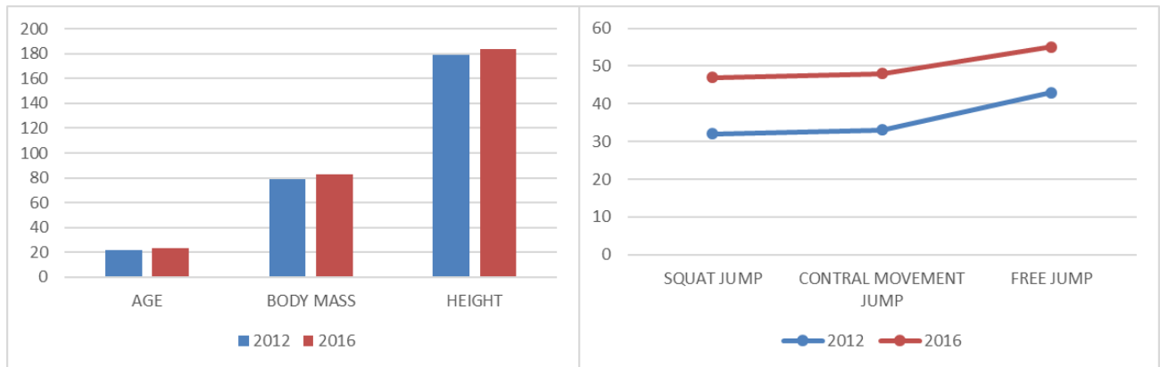
Figure 5. Wings and fullbacks results

The results of the explosive strength test are significant better for the 2016 players in all three tests. In all three tests, differences are higher than 10 cm. Also, the players who were tested both times show a very good evolution over the 4-year period. The results of the 2016 players are situated within the limits for international professional players (Brannigan, 2016). The third liners show the best results in free jump test, and for the other two, they are on the same level with the front row players.