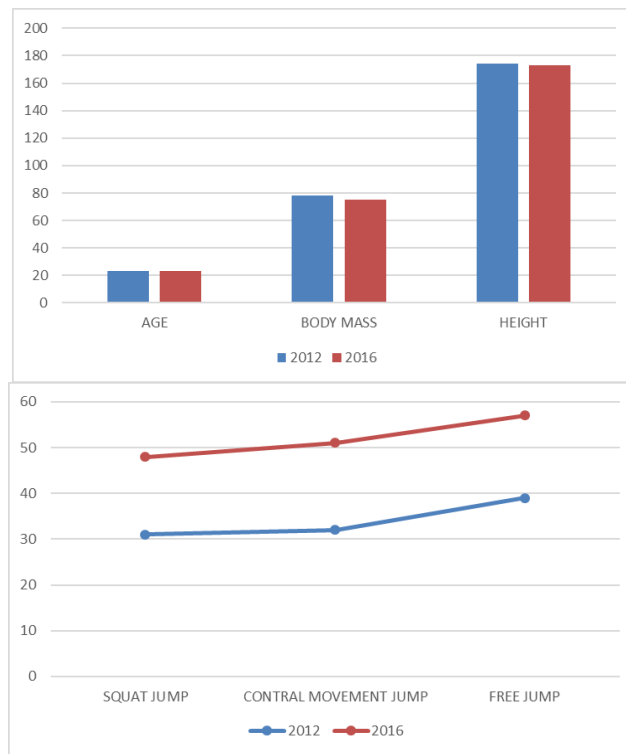
Figure 3. Halves results

In Figure 4, we see the comparison between the two second rows. We can observe significant differences in age and body mass. The 2016 show more appropriate results for a rugby first league second row, because the locks, through the nature of their attributions, are the players with the bigger height and body mass in a rugby team (Gabbett, 2002). Although the height is almost the same, the body mass difference is of 20 kg. The body mass is a key element for forwards, especially in the scrums and that is why the 2016 players show a better adaptation to the game needs (Nicholas, 1997).