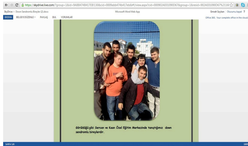
Figure 2. The Candidate Teachers with the Down Syndrome Students at the Special Education Centre

The teacher in the role of a guide, in this process, gave feedback to the candidate teachers about the activities they arranged. They did this every week in a classroom setting. In the 10th week, the candidate teachers prepared their project reports and presentations and handed in the relevant people in the Special Education Centre and their course lecturers. At the end of the study, the scales of post-tests were applied and a number of interviews were carried out by the researcher with one student from each group. An appropriate environment was prepared for the learners to give accurate and sincere answers to the questions during the interviews. A voice recorder was used during the interviews, each of which lasted approximately 15-20 minutes.