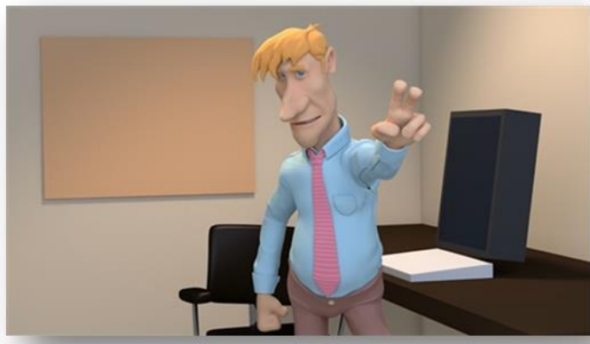
Figure 2. Animated character of people in video