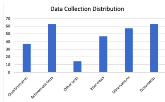
Figure 3. Distribution of the articles on DGS according to their data collection tools

The frequencies and percentages of the data collection tools used in the studies examined are shown in Figure 3 as a graphical distribution. So, it can be seen that the most preferred tools are documents ( f = 63 , 22.4%) and achievement tests ( f = 63 , 22.4%), which are followed by observations ( f = 57 , 20.2%), interviews ( f = 47 , 16.7%), questionnaires ( f = 37 , 13.2%) and other tests ( f = 14 , 5%).