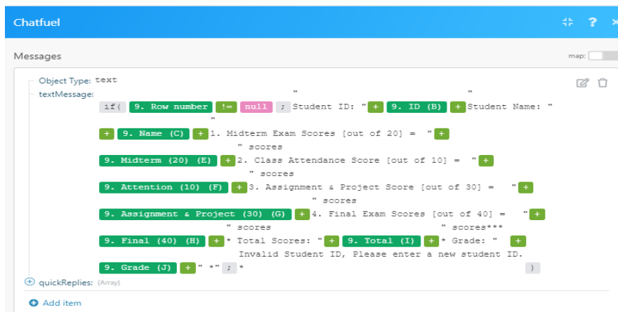
Figure 3. Sending results from an Integromat search results back to Chatfuel

During the pre-treatment (weeks 1-4) and treatment (weeks 5-6) period, the numbers of student-submitted assignments were counted and compared. Table 5 demonstrates that the percentage of submitted assignments made by the experimental group students during the treatment period was greater than those in the pre-treatment period. This demonstrates that there was a change in student engagement between the pre-treatment and treatment periods. There were statistically significant differences in students' submitted assignments (engagement) between the pre-treatment (traditional blended learning) and treatment (blended learning with chatbot) period of the treatment.