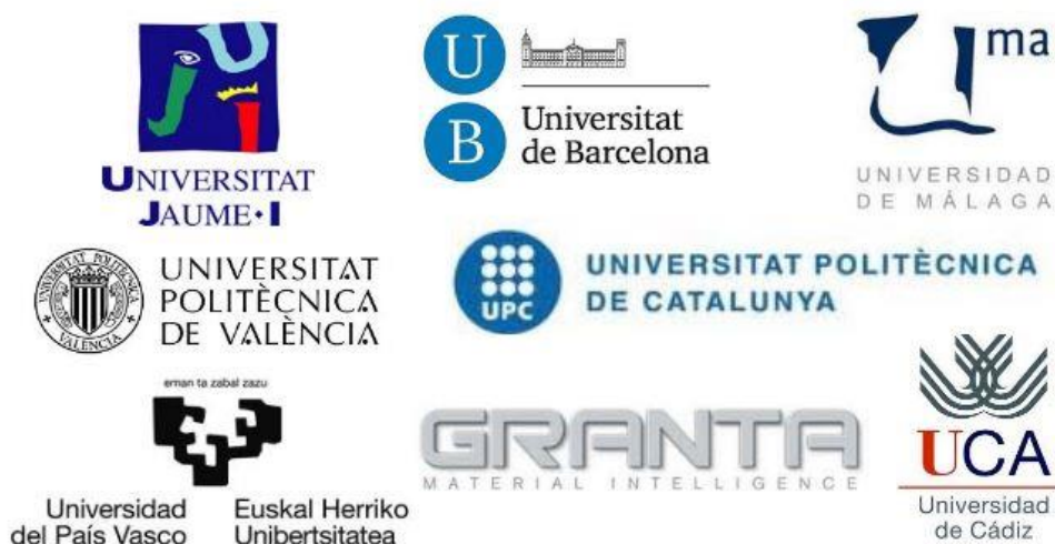
Figure 1. IdM@ti foundation member universities