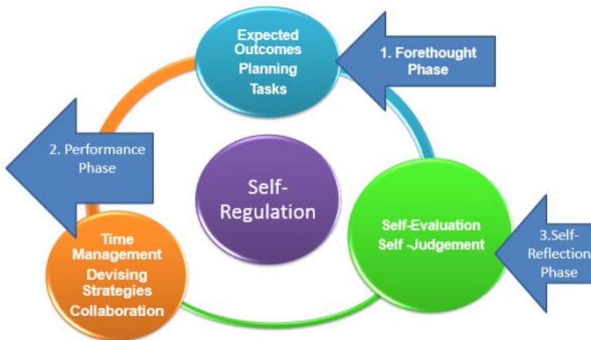
Figure 1: Self-regulated Model. Adapted from Zimmerman and Moylan (2009)

External norms enforced by educational institutions, as well as other environmental influences, can trigger self-regulated learning. As a result, there is a need to investigate learning environments that allow students to control their learning while performing certain tasks. The tactics that flipped learners adopt to participate in learning activities have been the topic of previous study initiatives. For example, findings from interview sessions revealed thirteen participants' distinct note-taking practices when attending video lectures from various platforms. Because it was used "to support studying, taking quizzes, or finishing writing tasks," note-taking promoted learner engagement as a task management method.